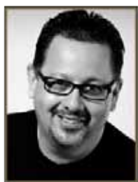
Rev. Jorge Acevedo

The theme for the June 6 -10, 2010 Annual Conference session is Love in Action: Building Bridges out of Poverty . Ministry with the poor is one of the four missional foci affirmed by the 2008 General Conference. As we gather at Lakeside, we will be celebrating the multiple ways the congregations of the West Ohio Conference are engaged in ministry with those living in poverty. In a variety of teaching sessions we will learn how we can help sisters and brothers build bridges out of poverty.